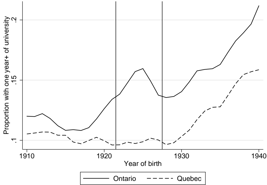
Figure 1: University attendance (%) by year of birth

or six, compared to eleven or twelve for their English speaking counterpart. Additionally, while under-prepared returning veterans from Ontario benefited from remedial programs, no such accommodation existed in Quebec. Consequently, even for those who volunteered in Quebec, the fact that their schooling level was well below high school made the VRA financial assistance program essentially irrelevant. The combination of lower educational attainment and lower participation rates in the war effort makes French Canadian men a potentially adequate control group for returning veterans from English-speaking Ontario.